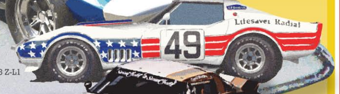
1981 Eppie Wietzes C3 back-to-back Trans-Am wins