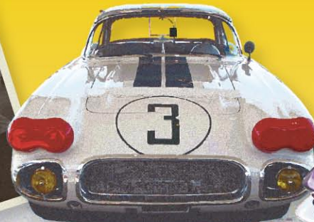
1960 Cunningham Corvette No. 3