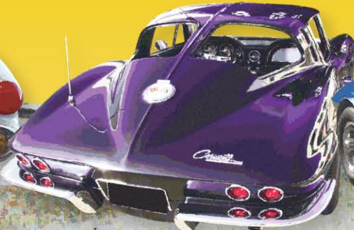
1963 Corvette Stingray Split Window Coupe