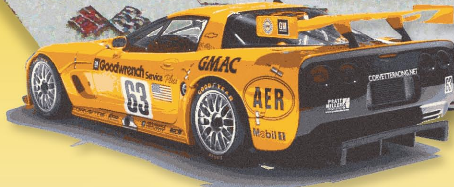
2001 C6R LeMans Class Winner. The first of seven wins to date