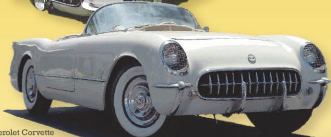
1953 Chevrolet Corvette